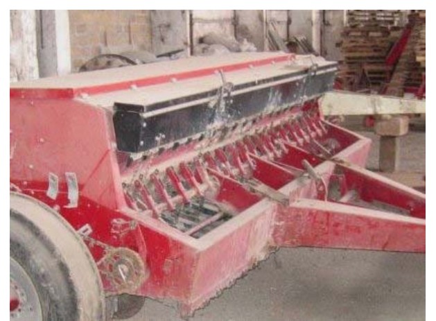
End of 2009 planting Season