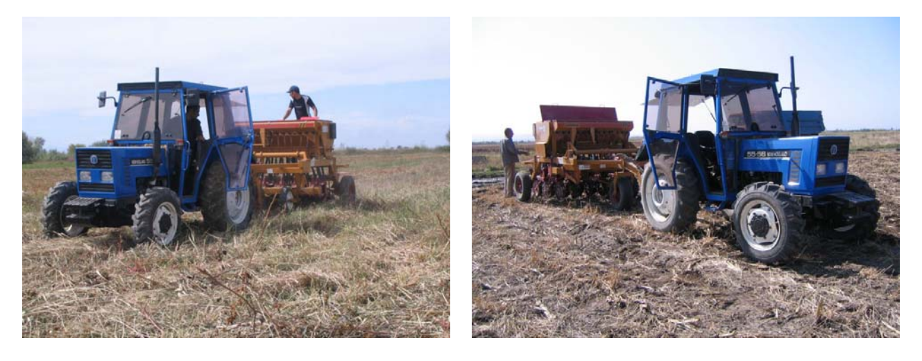
No-till equipment in demonstration fields in Lori (L) and Armavir (R) regions