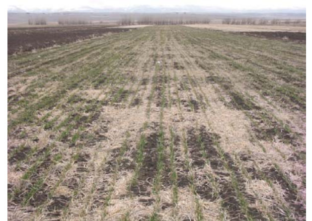
Early results of a no-till field planted in Fall 2008 (L)