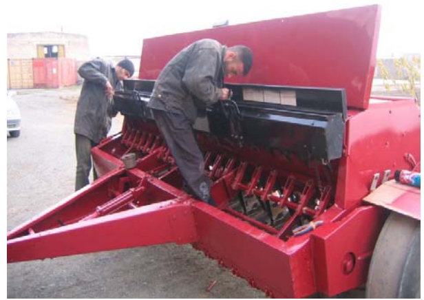
November 30, 2009 – Ready for Spring Planting

ATG stresses the up keeping of farm equipment to our staff. The pictures above demonstrate the CASE International Drill that the organization uses before and after its being repaired and maintained.