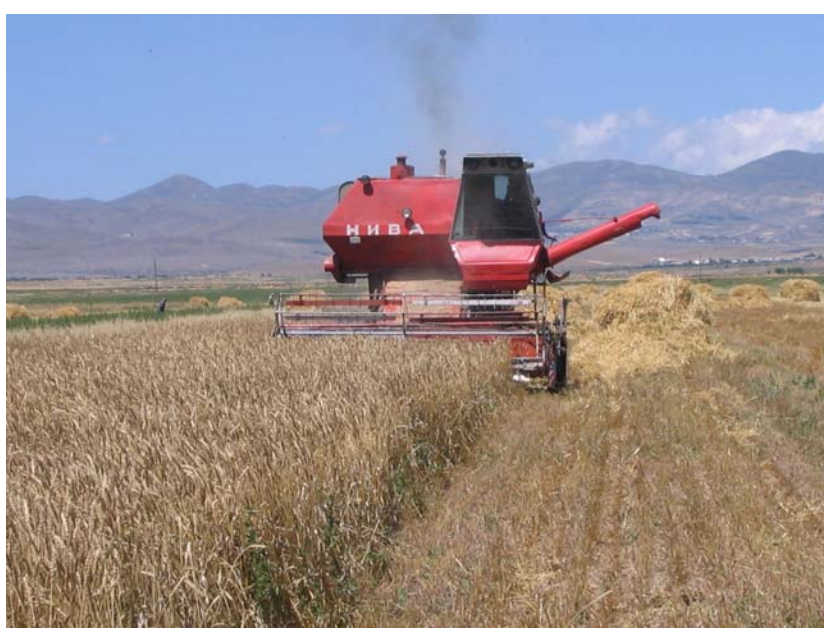
Harvesting no-till wheat field in Karnut Village Shirak Marz on August 13, 2009