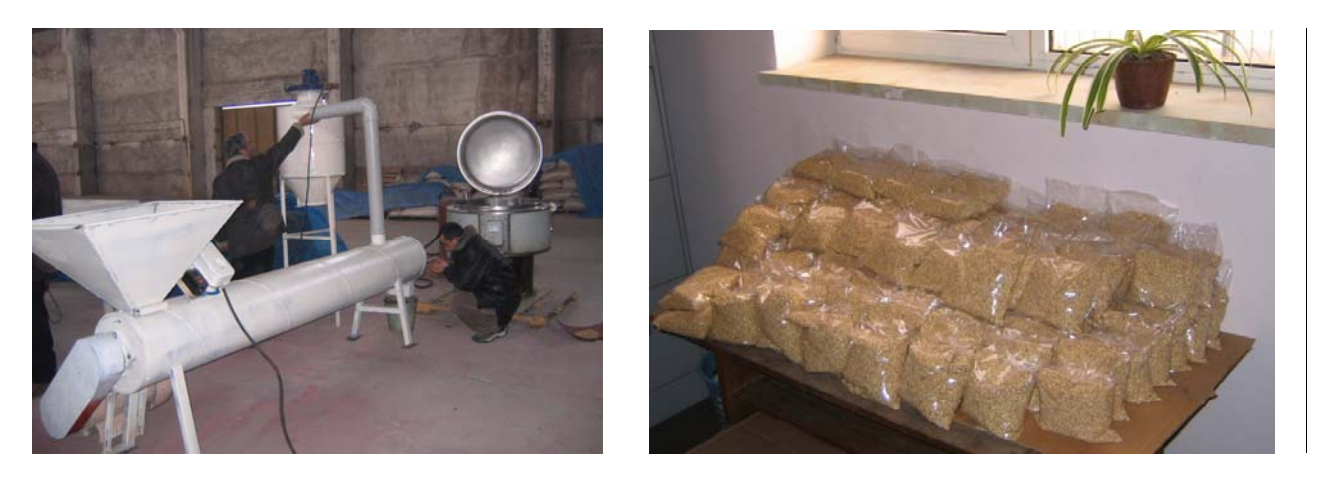
Processing equipment and bagged bulghur – ready to be marketed at local grocery stores