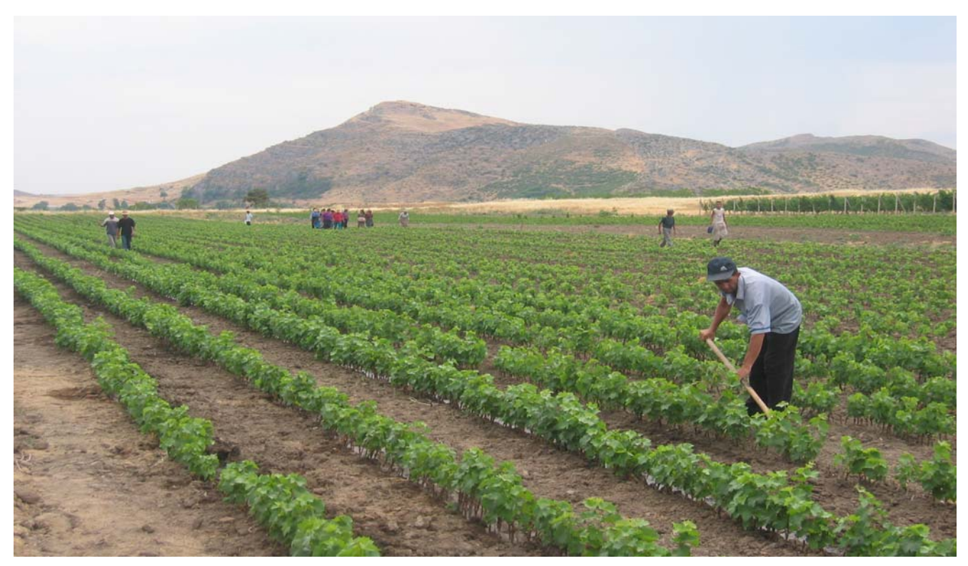
Villagers attain and irrigate the grafted grape seedling growing at the nursery

The value of these resistant rootstocks varieties are recognized all around the world. Thanks to your financial contributions ATG build a strong foundation that could save the vine industry in Armenia.