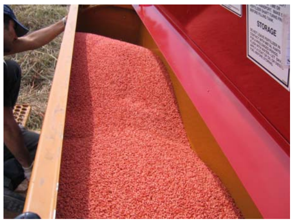
The harvested seed has been cleared, processed and treated with inoculants prior to planting in Fall 2009

For a successful seed industry to sustain itself, it takes seven generations of growing seasons for wheat seed, from it origin of R&D , to Breeder , Foundation , Registered , Certified and Common , prior to being used for various purposes and consumption. ATG established this process in Armenia.